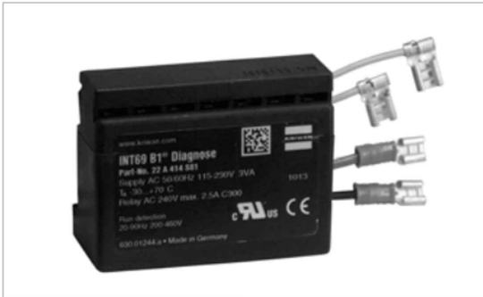
INT69 B1 Diagnose