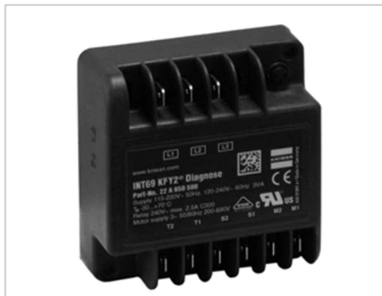
INT69 KFY2 Diagnose