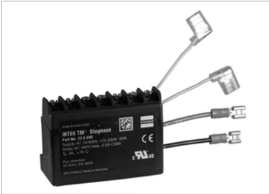
INT69 TM Diagnose